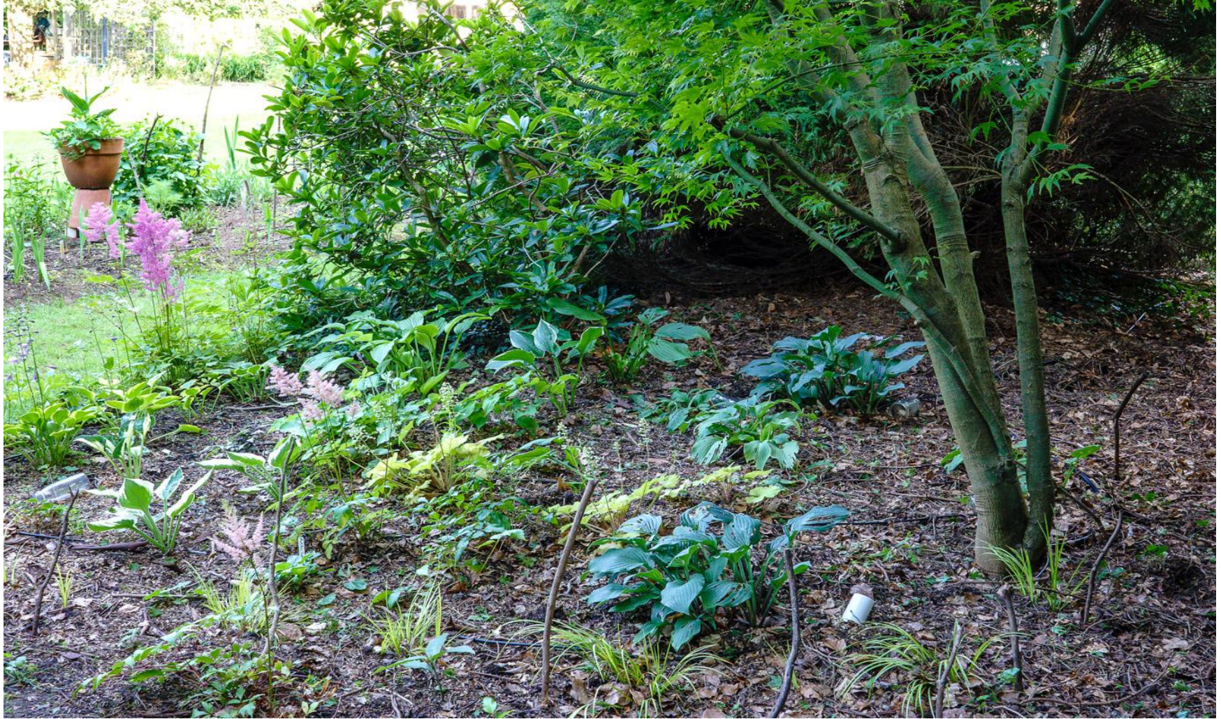
Shade under large Acer